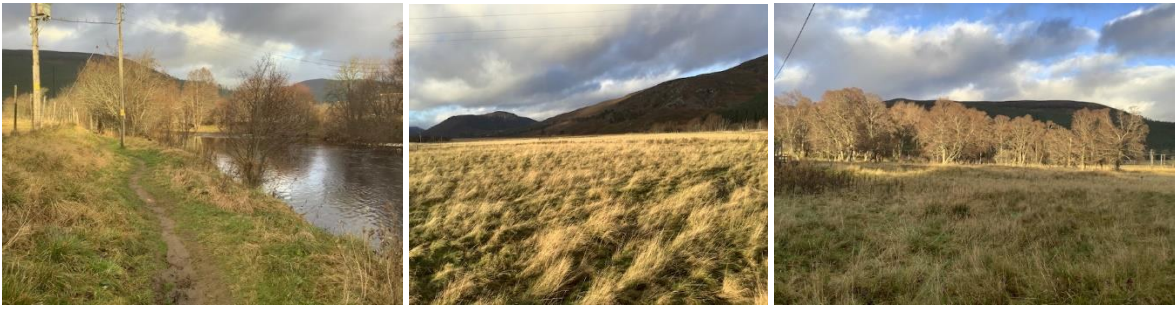
On the East is the river Clunie Views towards the North-West Trees on the village side.

The area comprises a mixture of woodland and open field. There are also three small streams with some associated wetland. There is a stockproof fence, but the site is frequently visited by deer and there is no regeneration of trees. The path along the river Clunie river is beautiful but narrow and slippery. The views across the open field towards the North and upwards the Dee valley are magnificent. There are two routes of access at present. One on the east side via a bridge over the river Clunie with a walk along the narrow path along the river to access via a gate. The other is via the village, on the corner of St Andrew's Terrace, around the electricity building through a gate on the north-west side of the land.