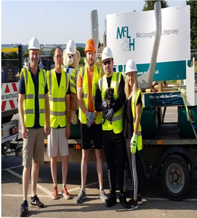
“The Protectors” The team including Harvey the mascot and Paddy the Therapet