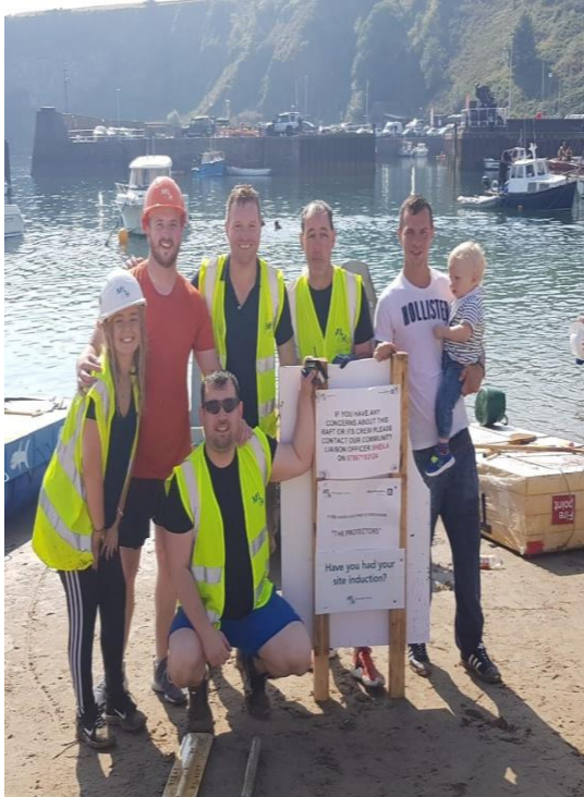
The team came in third and received medals and £50 donation prize which was given by the organisers of the event