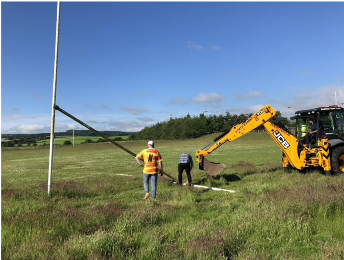
Photo of Post from lower pitch being removed following Seller and their agent's insistence

Our incumbent landlord at Redcloak, has made it clear that there will be no renewal or extension of our current lease when it expires in six years' time for the remainder of the facilities. They have ambitions for alternative uses due to the proximity to small businesses and the recycling centre. He is unwilling to offer any other area of land for purchase by the club which provides long term security for the club.