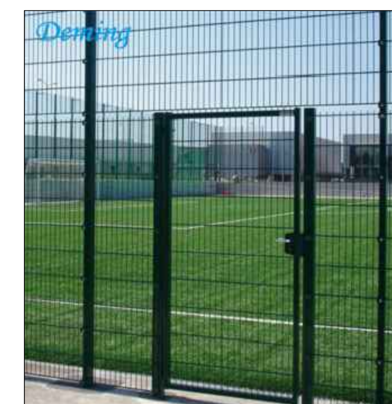
Typical Fence Detail with pedestrian pass gate 3.0m - NTS (Type and size to be confirmed on discussion with planning service)