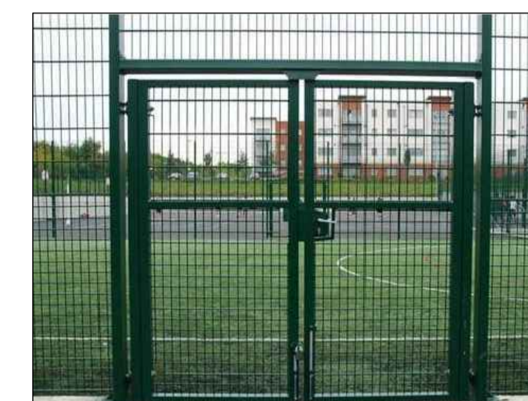
Typical Fence Detail with double pass gate 3.0m - NTS (Type and size to be confirmed on discussion with planning service)