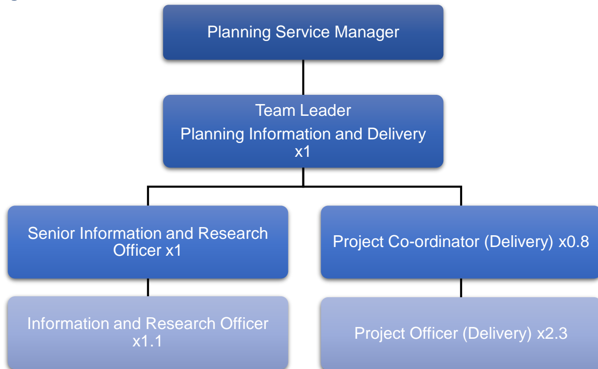
Figure 2: Team Structure