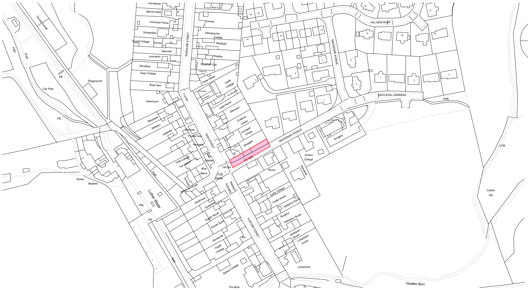
1 Location Plan 1 : 2500